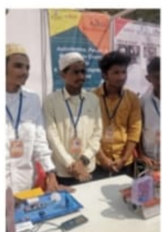
Student Entrepreneurs showcasing their innovations at NES Start-up Fest