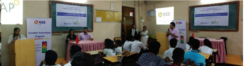
“Financial wisdom” by Investor Awareness Employability Skills & Creativity