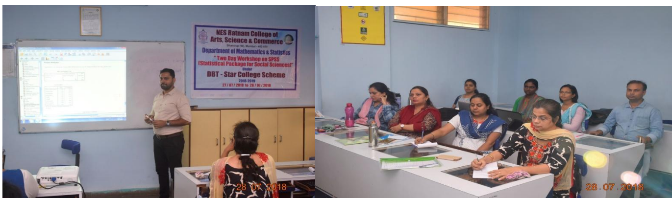
“SPSS- Statistical Package”