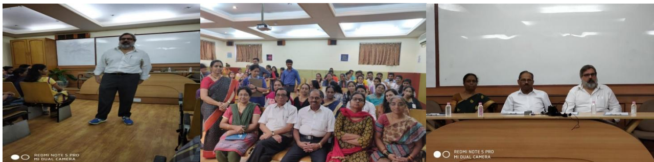
“Employability Skills and Creativity”

Need based training programs like use of latest ICT tools in Teaching-Learning Process, Learning Management Systems, Training towards personal & professional growth are conducted