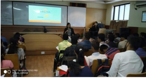
Seminar on Digital Marketing