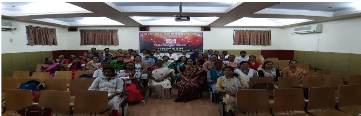
Training for non-teaching- UNMESH

This year the theme of the workshop was 'Environment Friendly Office Administration'