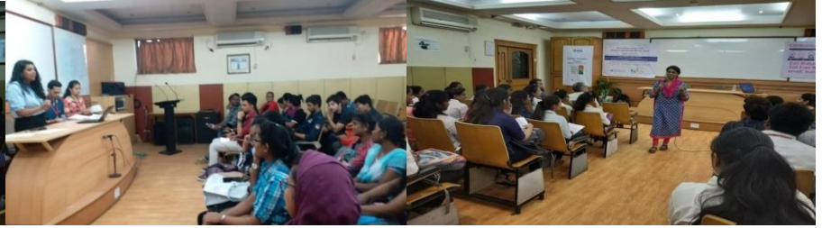
Training session by NGO Techno Serve