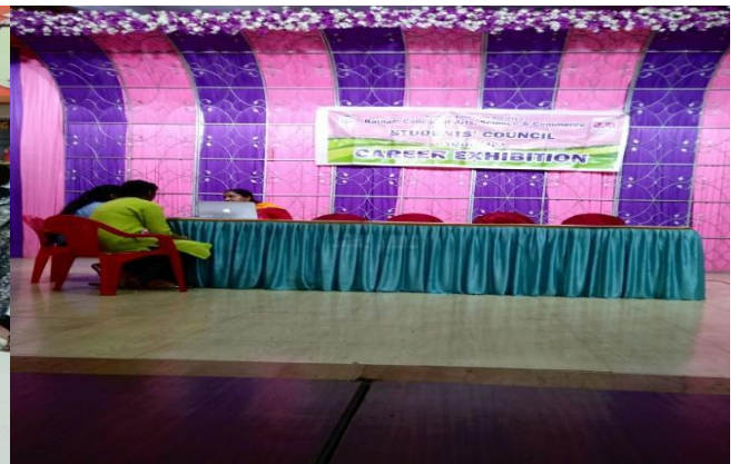
“Career Guidance in Public Sector and Actuaries”